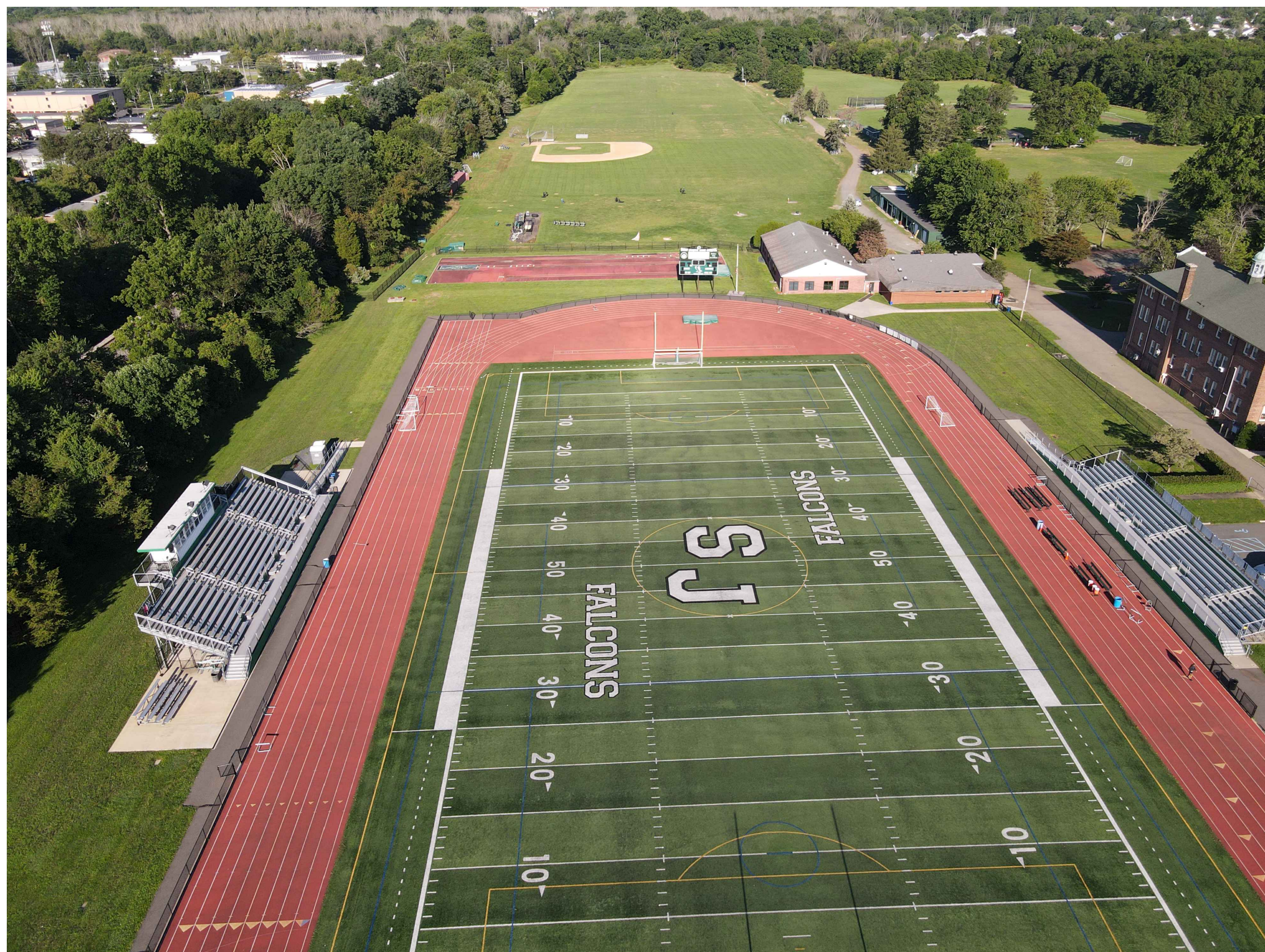
2 Drone Image, Looking West