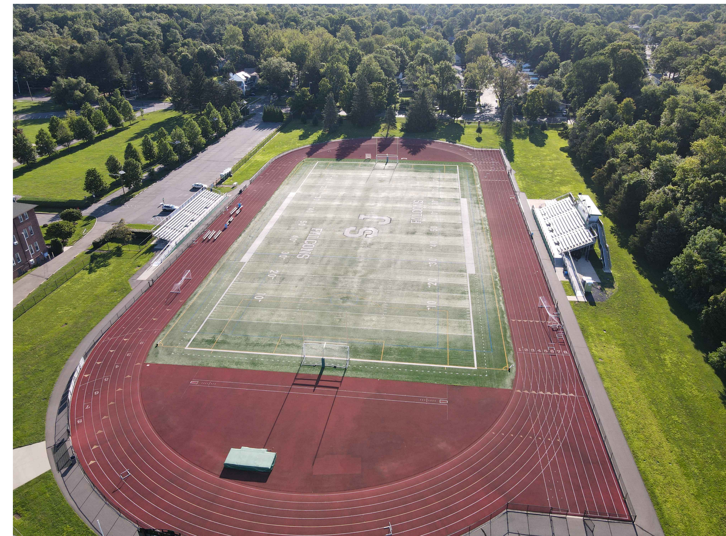
3 Drone Image, Looking North