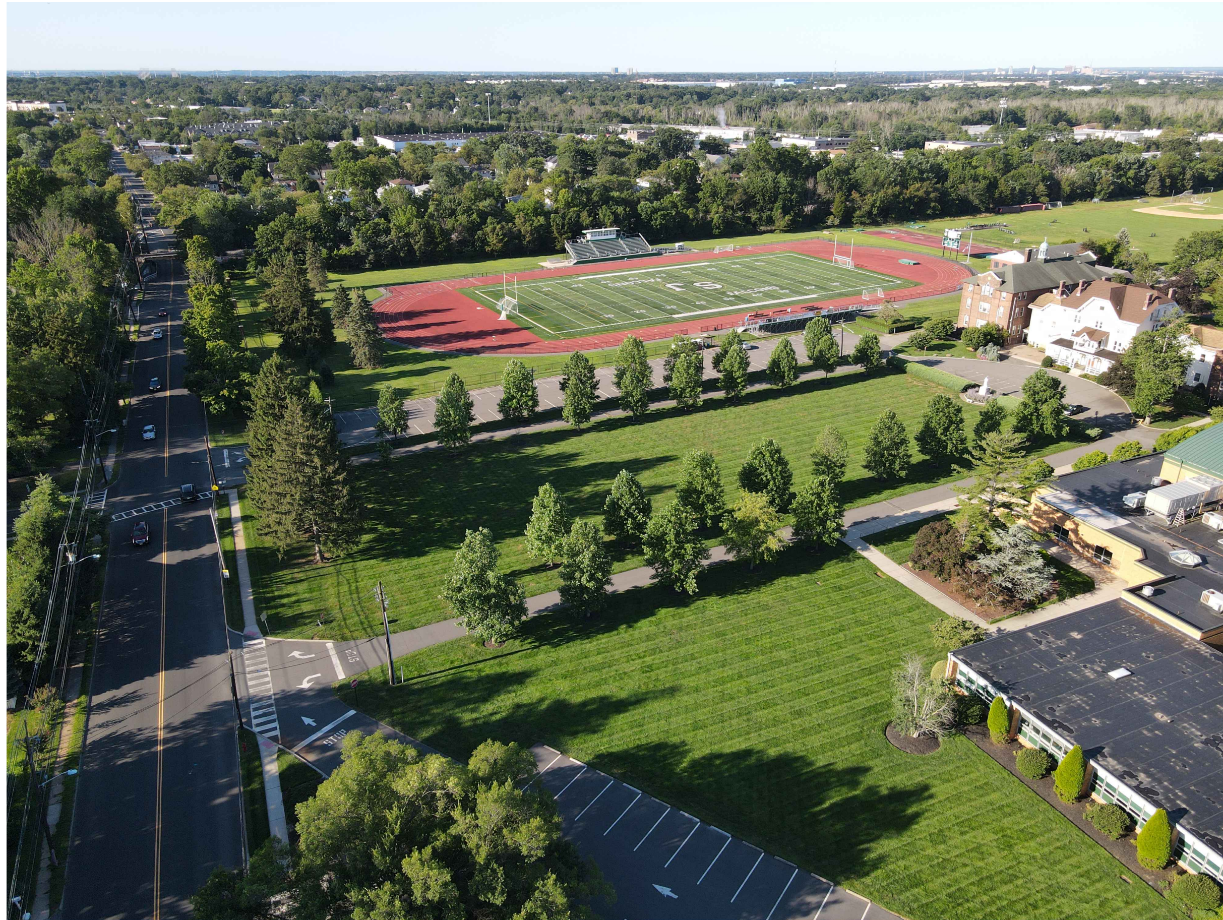
1 Drone Image, Looking South