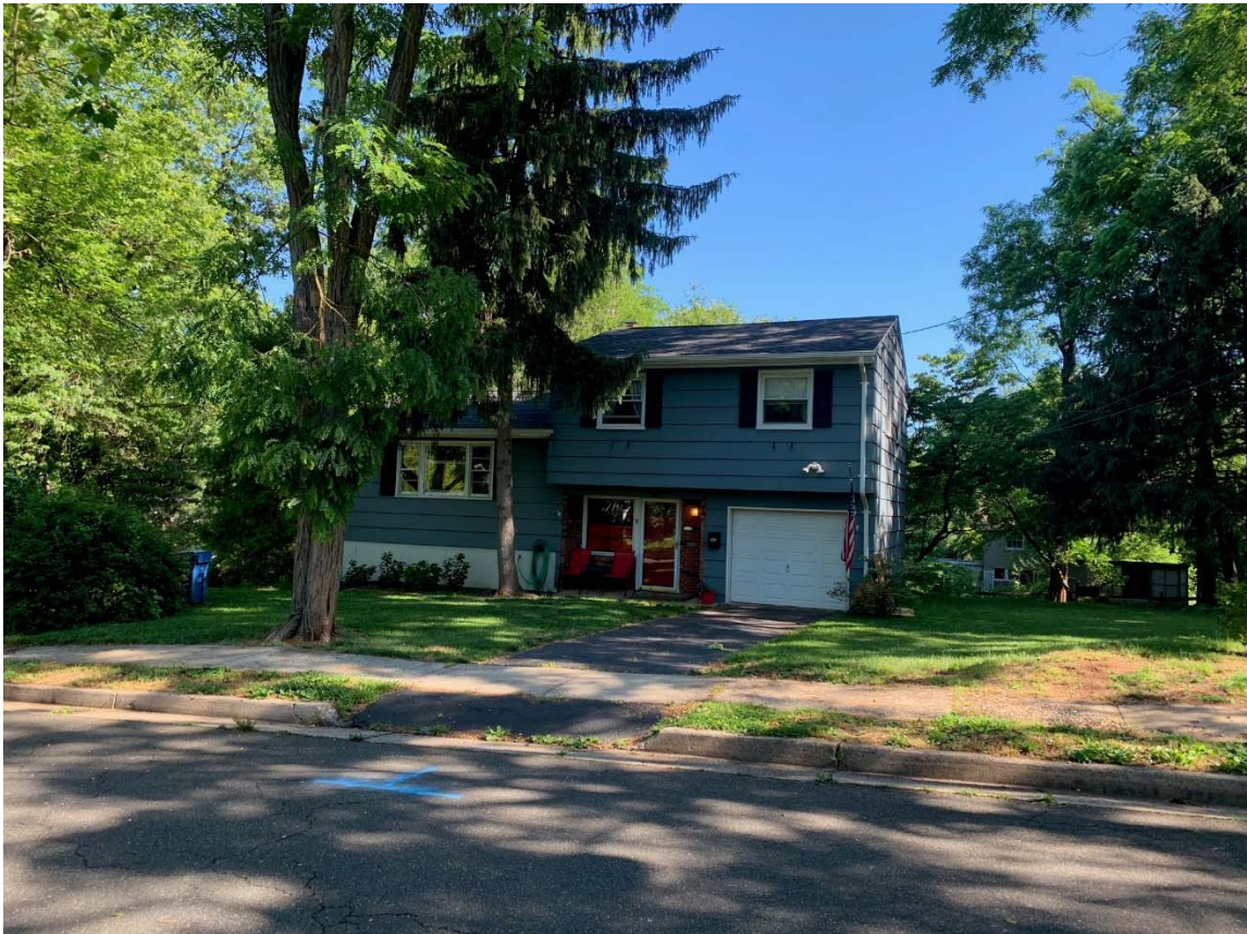
11 ROLFE PLACE BLOCK 141, LOT 85