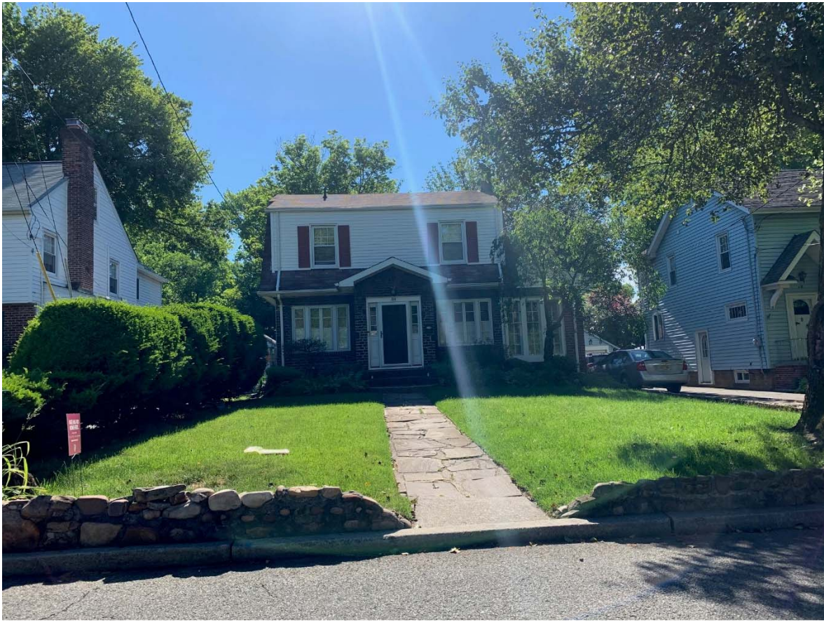
114 ROSE STREET BLOCK 143.01, LOT 11