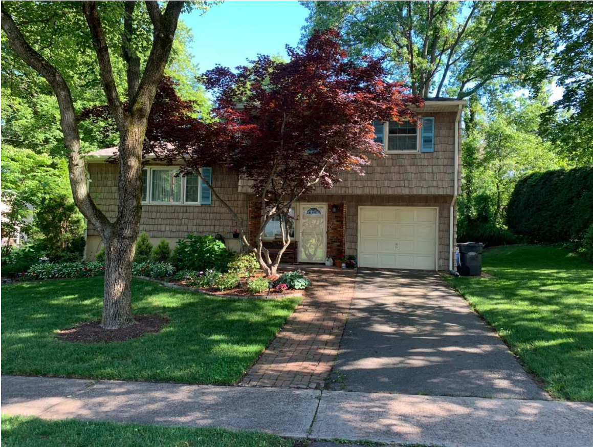
26 ROLFE PLACE BLOCK 141.01, LOT 94