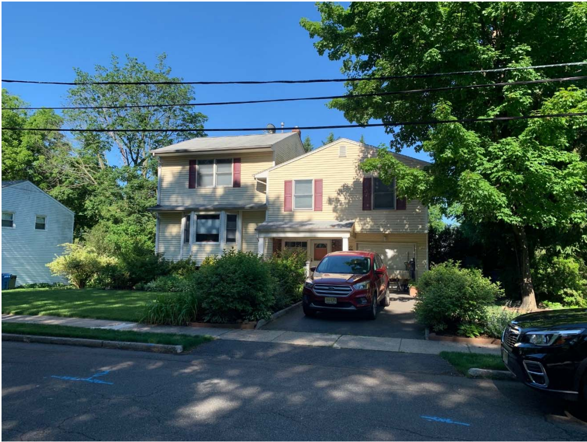
23 ROLFE PLACE BLOCK 141, LOT 88