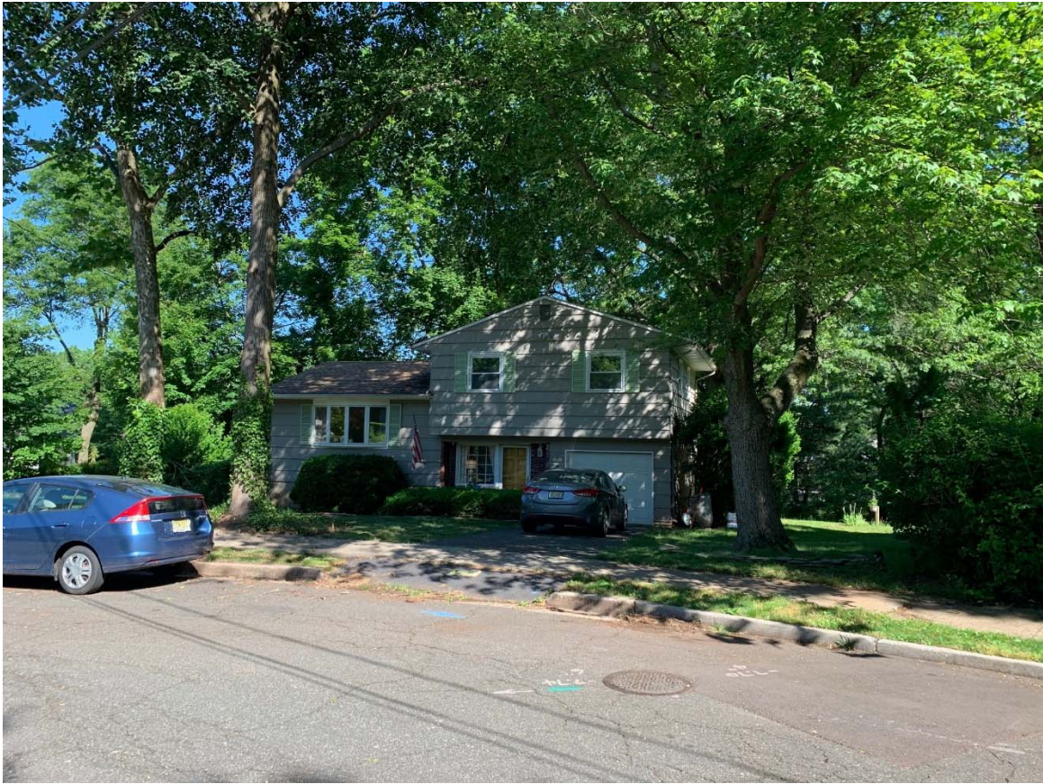
15 ROLFE PLACE BLOCK 141, LOT 86