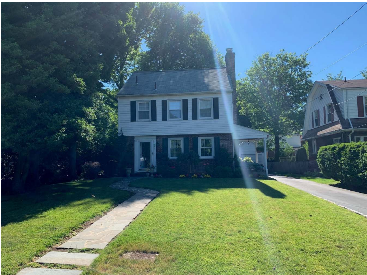
110 ROSE STREET BLOCK 143.01, LOT 1.02