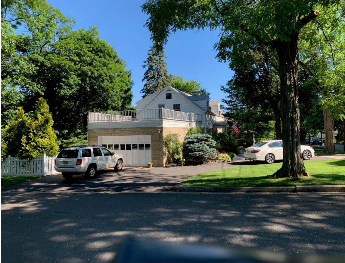
89 ROSE STREET BLOCK 141, LOT 28.02