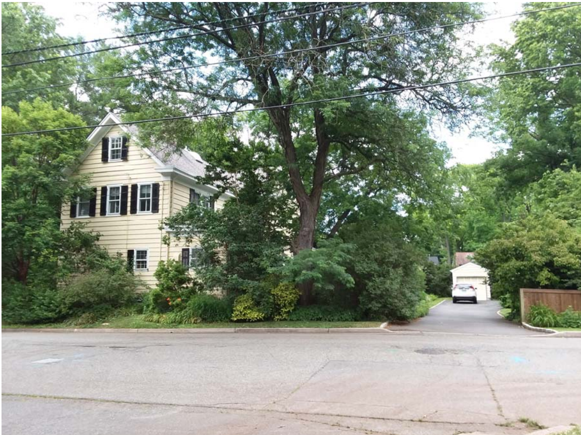
96 ROSE STREET BLOCK 143.01, LOT 1.02