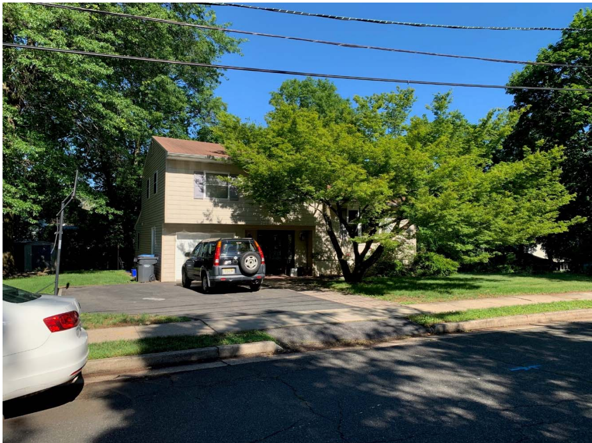
19 ROLFE PLACE BLOCK 141, LOT 87