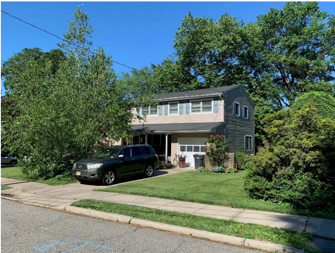
115 ROSE STREET BLOCK 141.01, LOT 93