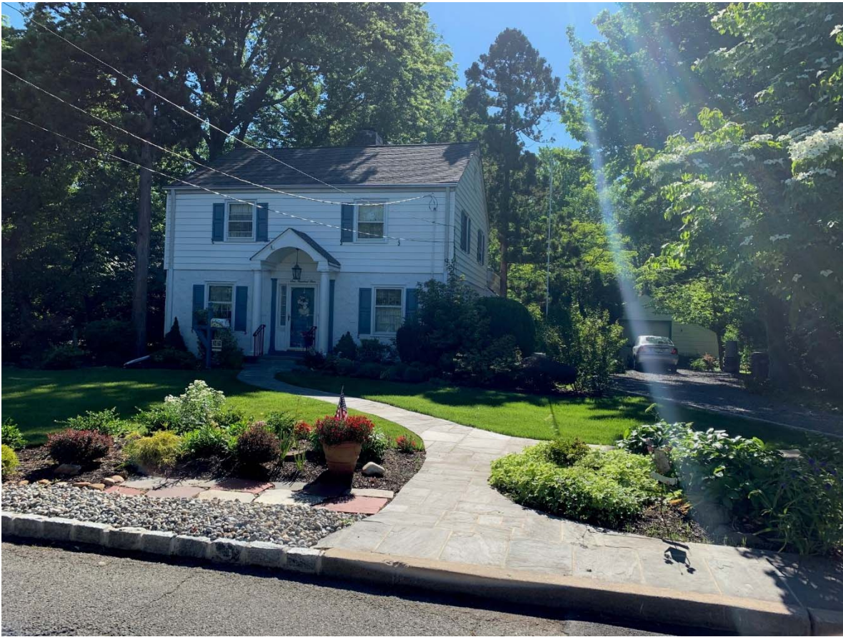
104 ROSE STREET BLOCK 143.01, LOT 1.03