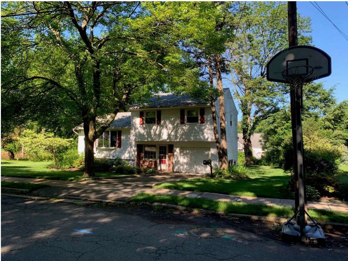
27 ROLFE PLACE BLOCK 141, LOT 89