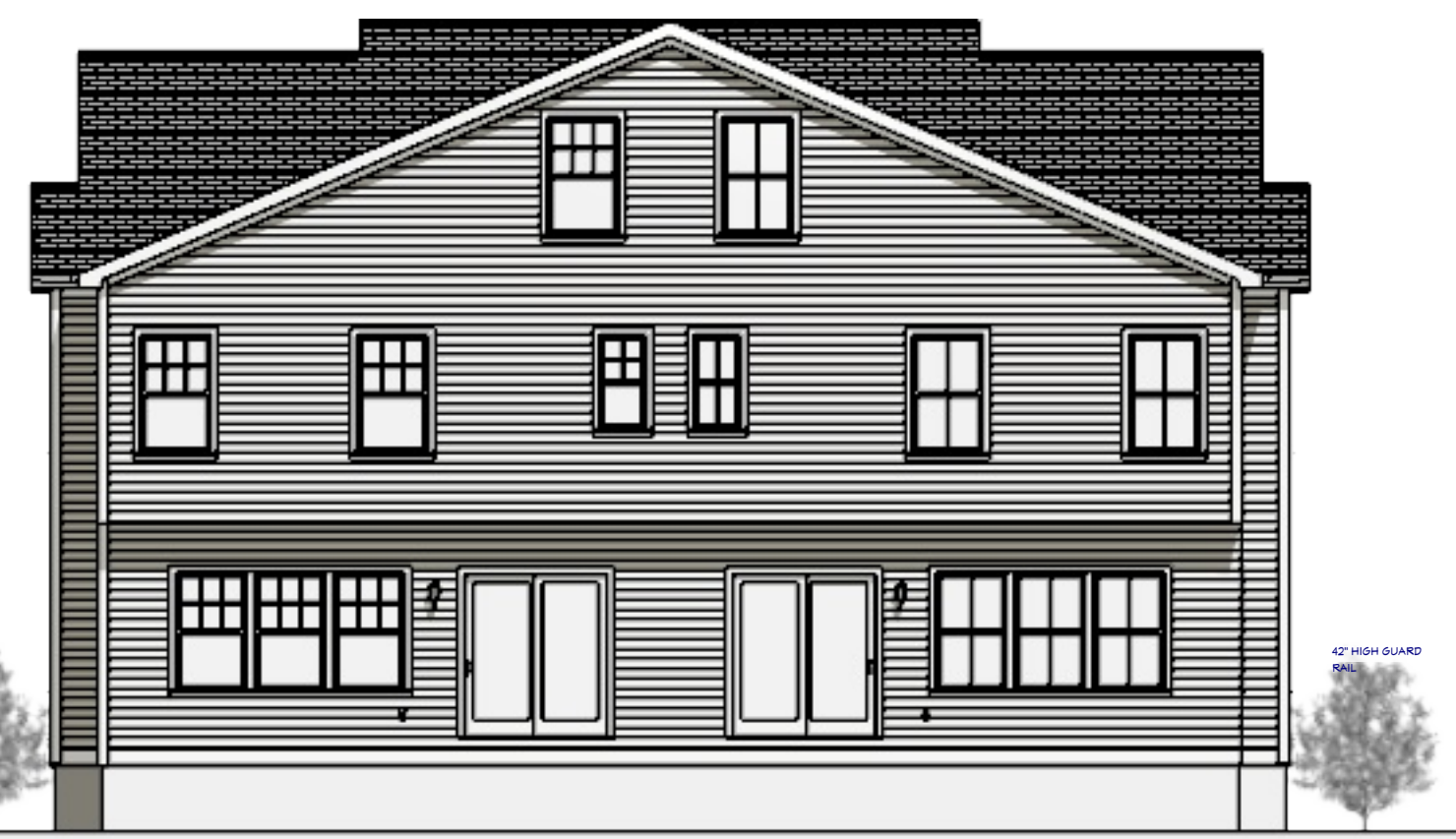
REAR ELEVATION 1/8 in = 1 ft