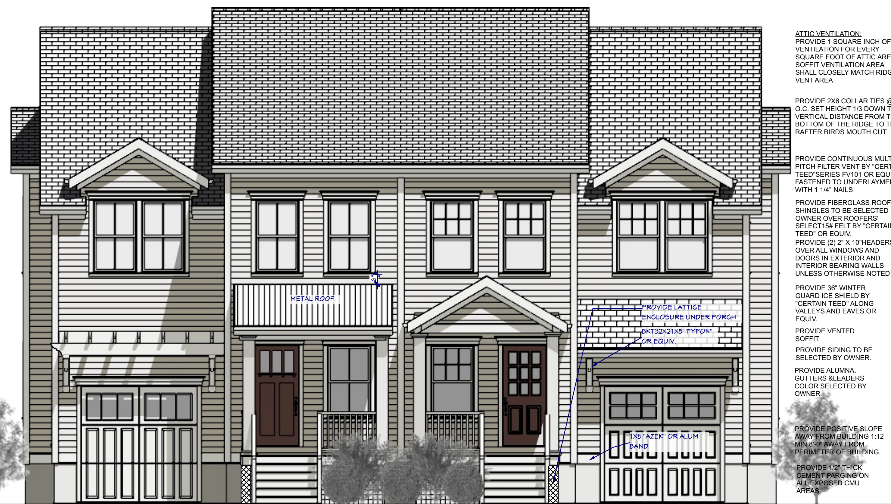
FRONT ELEVATION 1/4 in = 1 ft

ATTIC VENTILATION: PROVIDE 1 SQUARE INCH OF VENTILATION FOR EVERY SQUARE FOOT OF ATTIC AREA; SOFFIT VENTILATION AREA SHALL CLOSELY MATCH RIDGE VENT AREA