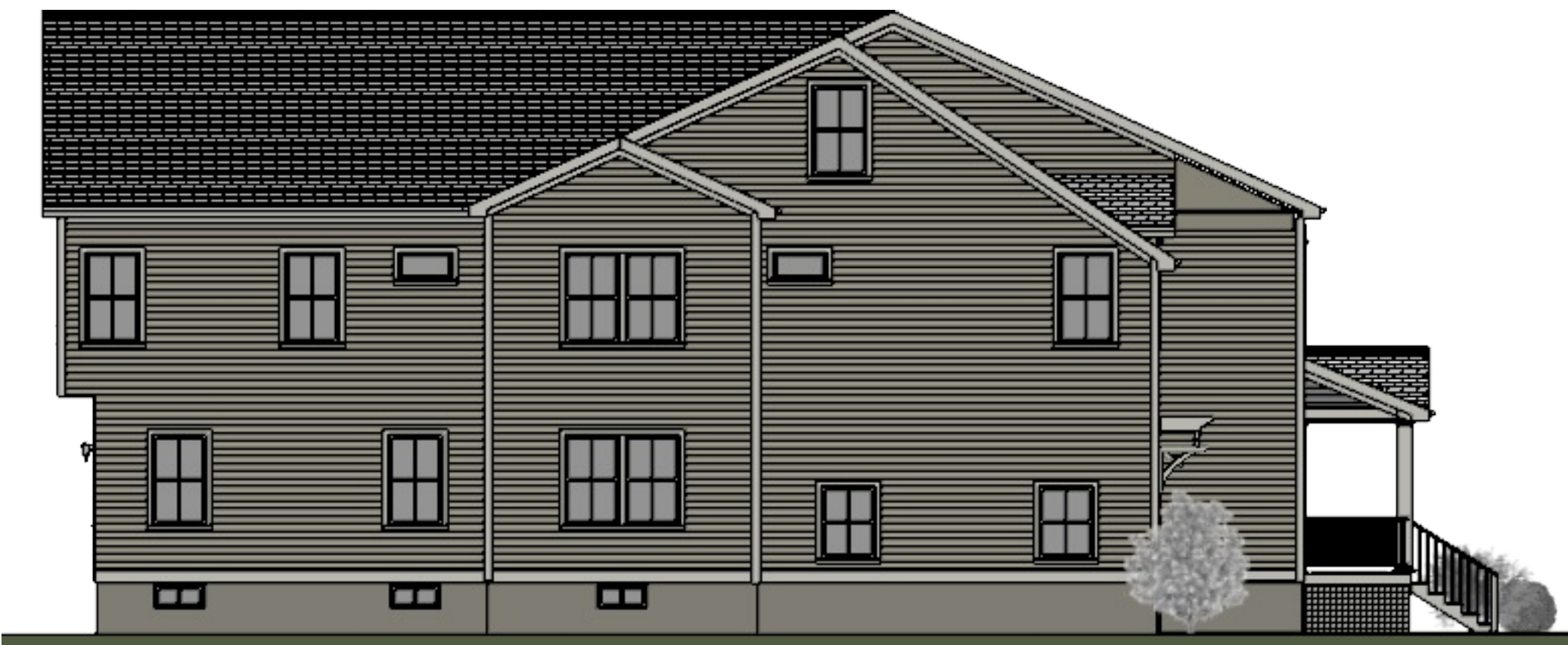
LEFT SIDE ELEVATION 1/8 in = 1 ft