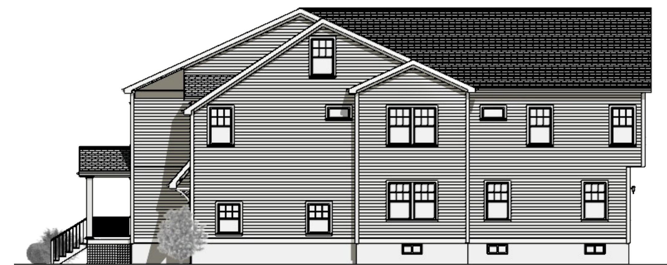
RIGHT SIDE ELEVATION 1/8 in = 1 ft

SQUARE FOOTAGE FOR EACH DWELLING 1260 SF - FIRST FLOOR (268 SF GARAGE - 1528 SF FOOTPRINT) 1576 SF - SECOND FLOOR 2788 SF - TOTAL SF PER DWELLING